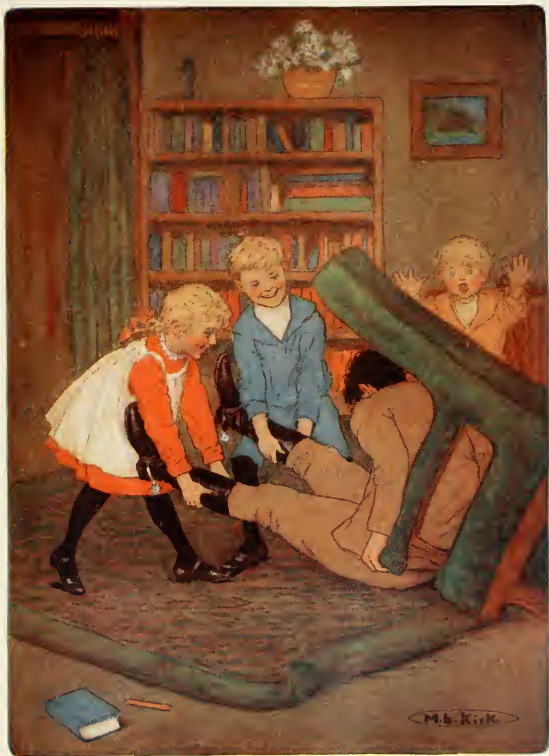
BEFORE JUL COULD PREVENT IT HE WAS PULLED OFF HIS CHAIR